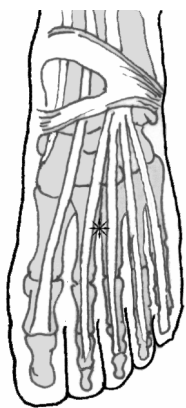
Men 2 Jin 1